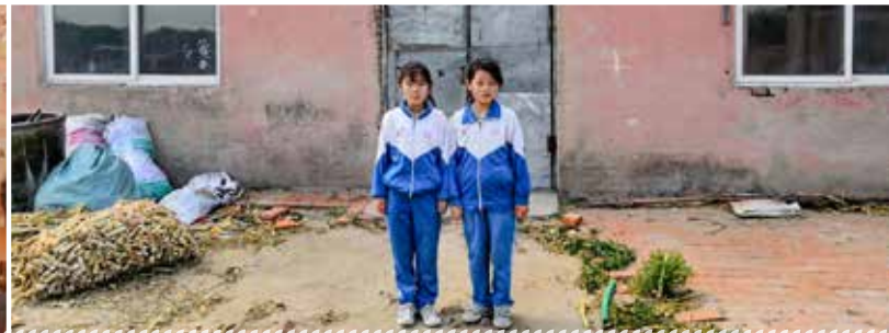
LAF Children Support, Liaoning Province, China