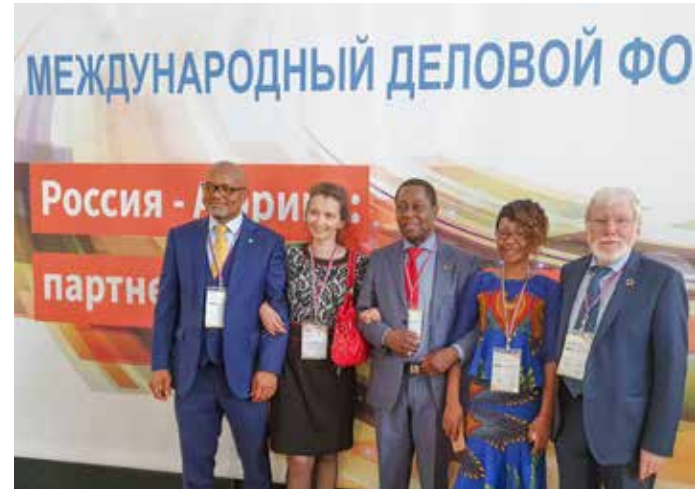
African Investment Conference in Moscow, Russia