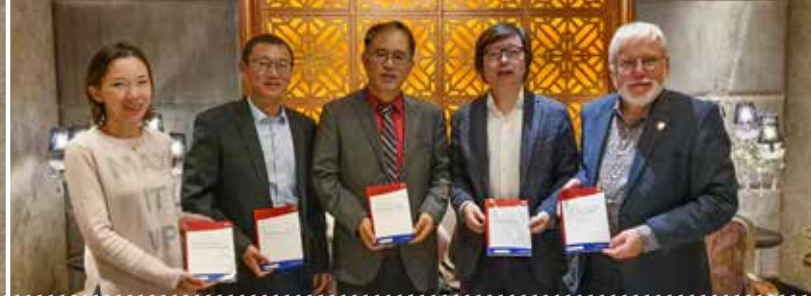
GAF Ethical investments publications