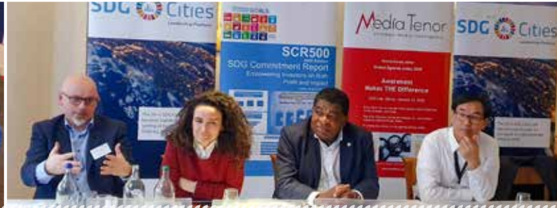
SDG Panel at Davos World Economic Forum