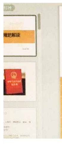
| Programme 1 KBC Online course on Law and Ethics