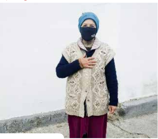
| Programme 2 Uzbekistan food aid